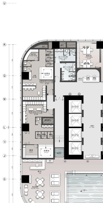
Figure 2: Changing Room / Page 1